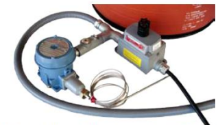
NEMA 7 Controller and High Temperature Limit Indicator Light