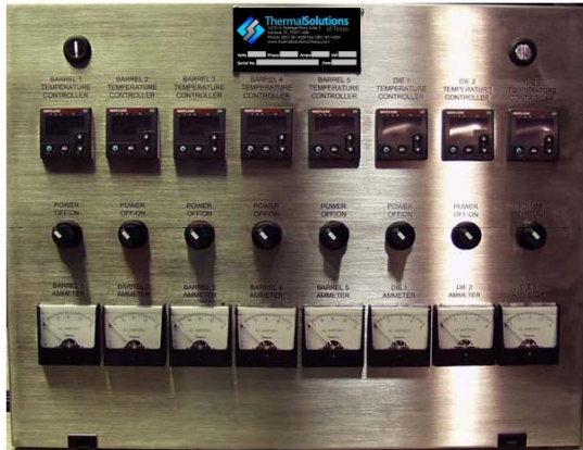
8-Zone, Stainless Steel Control Panel, featuring Watlow SD Series Controllers

Thermal Solutions of Texas manufactures temperature and pressure control panels to meet your control system needs.