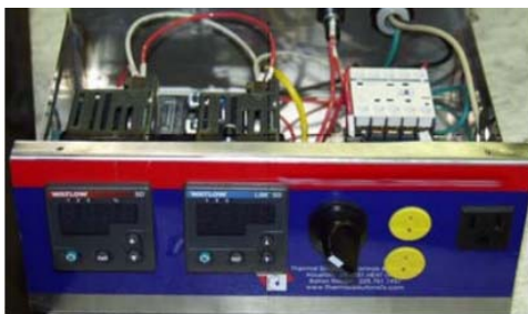
Desktop Control Console with High Limit